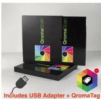
Qroma Total Bundle

* Photos should be removed from albums or frames prior to sending in. Digital images can be saved to disc or digital download in TIFF or JPG format, you can choose on the order form. Promo codes cannot be combined. Offer expires February 13th, 2019. Call for more details: (801) 782-5155.